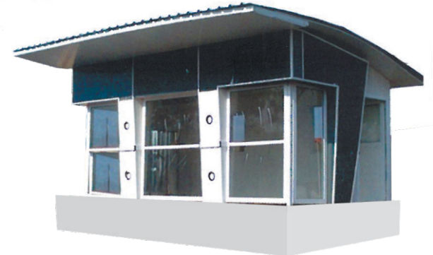
Water Supply Cabin