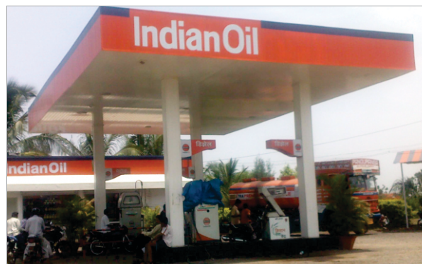
Canopy for Petrol Pumps